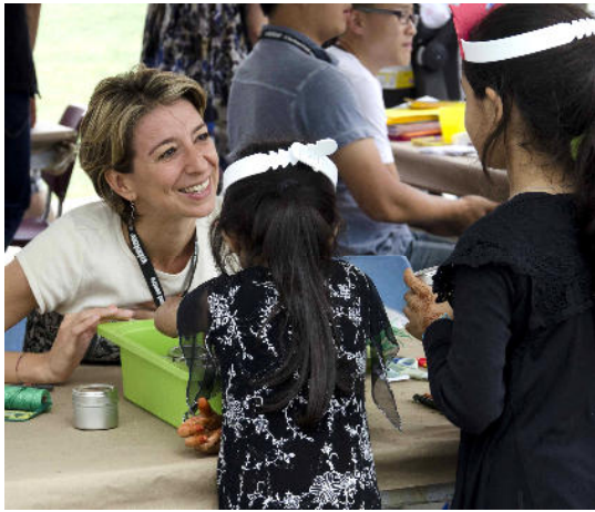
Letizia sharing a smile at the Dig In activity